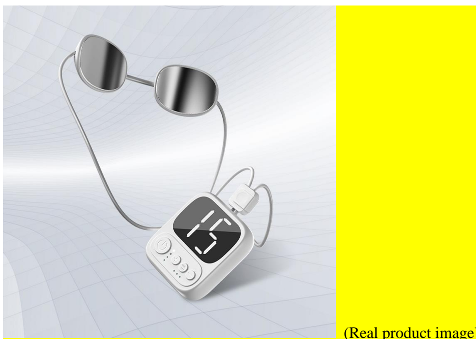
(Real product image)