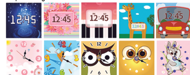
Top row: Digital clock faces. Bottom row: Analog clock faces.

When the home button is pressed, the clock will be displayed. Tap the center of the screen to switch the clock face between analog and digital. Swipe left or right on the screen to see more clock faces.