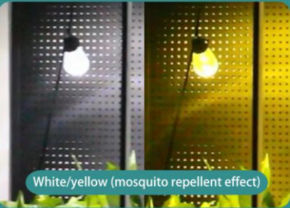
White/yellow (mosquito repellent effect)

The product has three key functions: white light (conventional white light illumination) / yellow light (mosquito repellent 575-580nm) / off