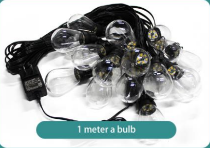
1 meter a bulb