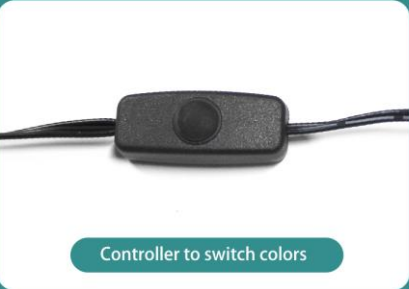
Controller to switch colors