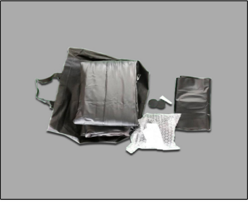
2. Take out the other content, and prepare the air pump.