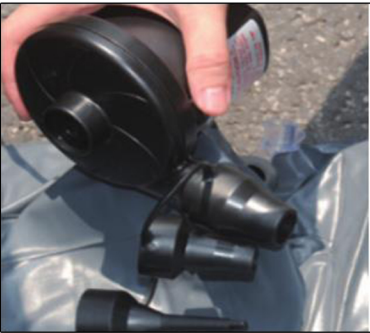
5. Attached the large nozzle into the air pump.