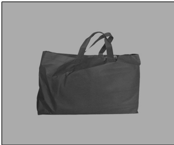
1. Unpack the carrying bag and remove the air bed.