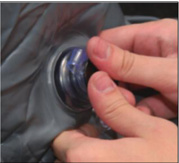
7. Cover the lid of the large valve.