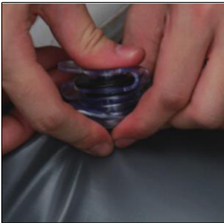
9. Close the lid of the middle valve once the bed is fully inflated press firmly the valve into the mattress.