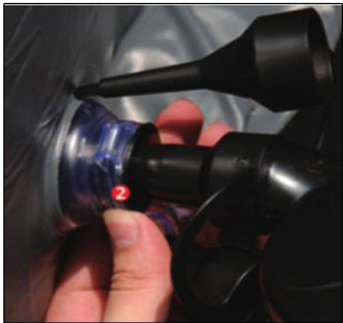
8. Use the middle size nozzle to fill the air bed.