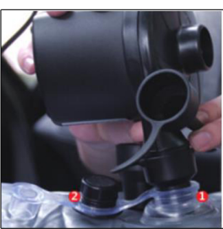
6. Inflate the air bed 70% using the large nozzle and cover the lid of the large valve.