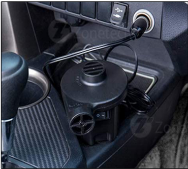
4. Insert the cigarette lighter plug into the air pump and turn on the switch. Note: Start the car 3-4 mins then insert the air pump.