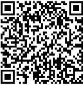
QR Code for the “King of Archer” App