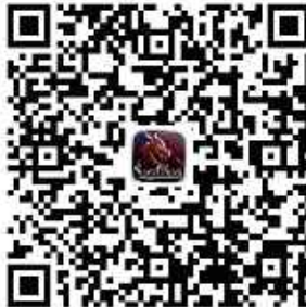
QR Code for the “Super Archer” App