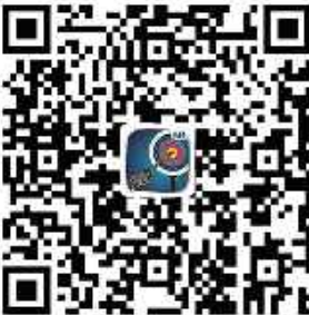
QR Code for the “King of Archer” App