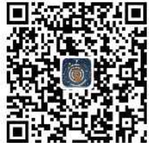
QR Code for the “VR Bow Hunt Deer” App