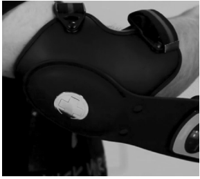
For the Elbow