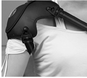
For the Shoulder